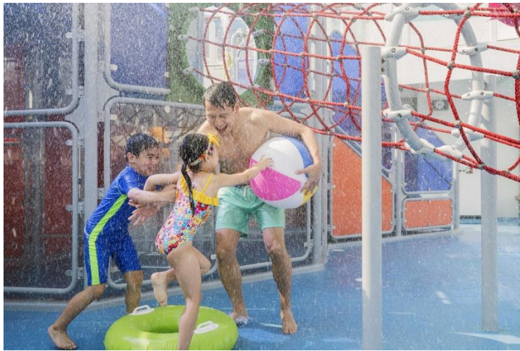
Kids' Water Park

Dream Cruises is elevating the “staycation” into a “Super Summer Seacation” for travellers who want a vacation experience unlike any that can be had on land.